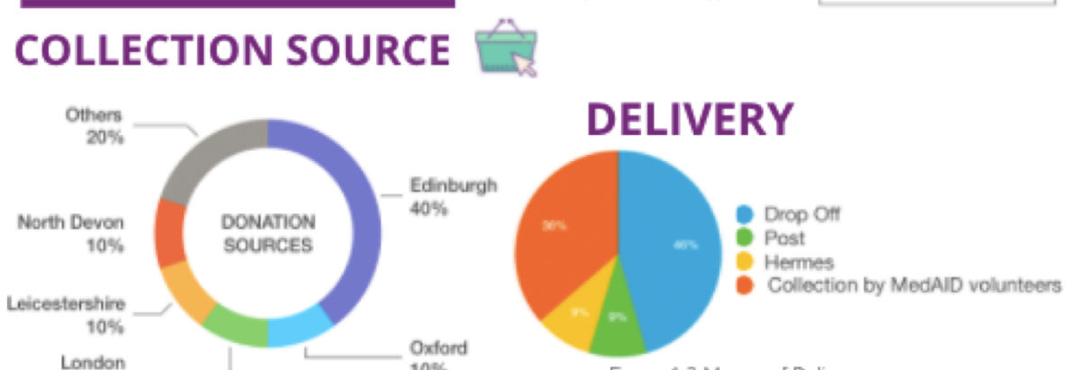
Figure 1.3 Means of Delivery